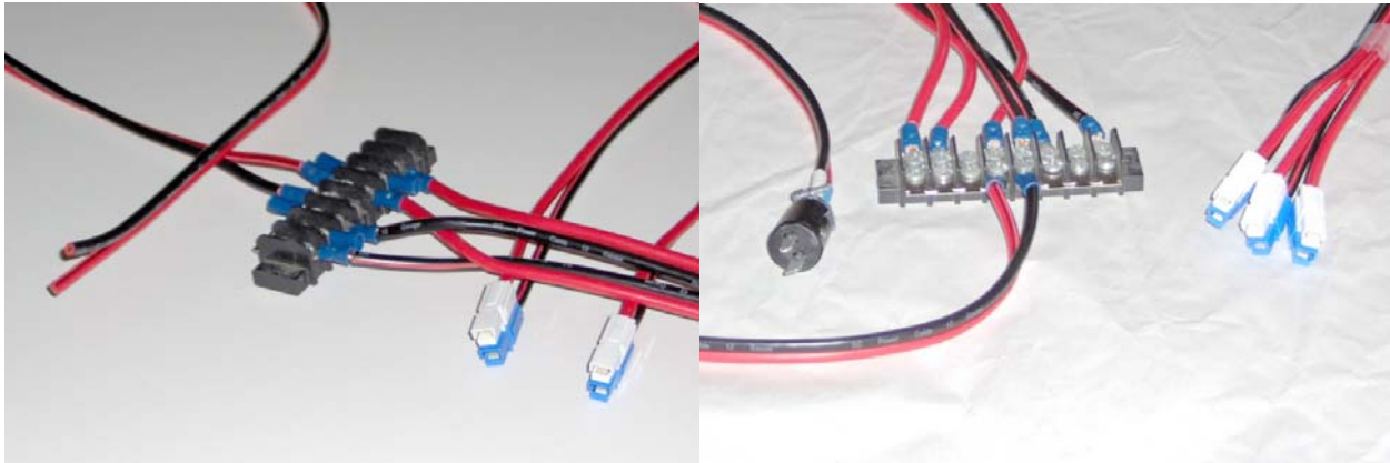
Terminal / splitter block

Approach 1: The initial feeder from the DCC booster or throttle should be white over blue PowerPoles, the same as the NTRAK right end. As T-TRAK does not have a continuous loop as NTRAK does, the "Y" cable is not needed. A terminal block is used to split the main feeders from a central location. This will allow the individual extensions to be the same for any direction. The end result is that you have 3 or more sections of wire radiating from a central buss bar. Two of the sections feature PowerPole connections while the third features a connection that is compatible with your power supply. If there is a polarity problem, the wires from your power supply can be reversed at the terminal block. See the picture below for a sample using this approach.