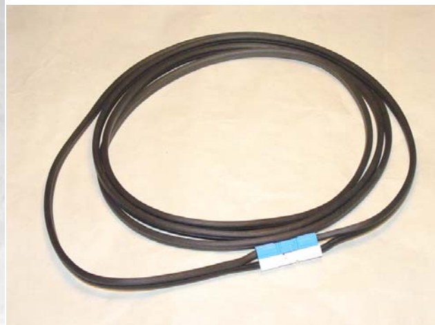
8 foot long bus wire made from low voltage lighting cable.