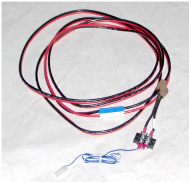
8 foot bus wire using 12v red/black DC power cable. The left end attaches to the cable from the terminal / splitter block.

The following pictures illustrate two different buss wires. The first includes the buss bar as discussed above to accommodate any type of wiring, while the second features only the wire and PowerPole connectors and is intended for use with the pigtailed described below.